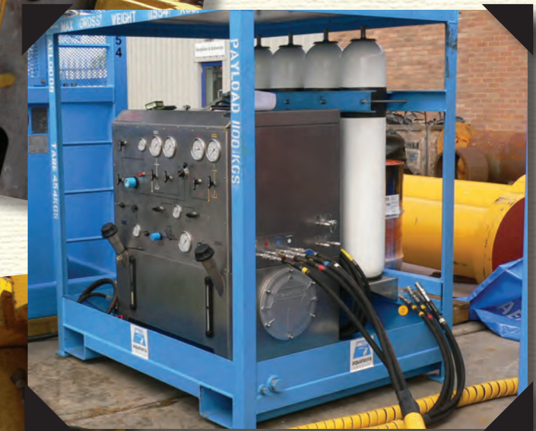
Hyco's Hydraulic Power Unit (HPU)