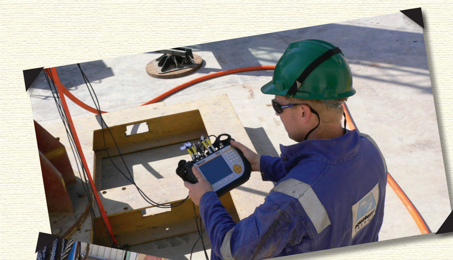
HPM6000 in use

The HPM6000 turned out to be as simple to operate as the average mobile phone, the graph readouts were clear and simple to understand, the battery only needed to be recharged once in three days of testing and, despite the fact that the work was conducted in bright sunlight, the equipment screen was clearly visible.