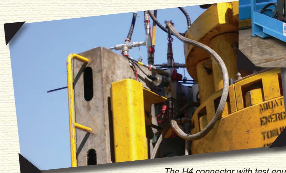
The H4 connector with test equipment attached