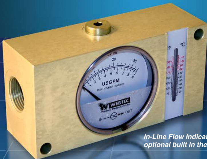
In-Line Flow Indicator with optional built in thermometer

The flow indicator consists of a sharp edged orifice and tapered metering piston. The piston movement is directly proportional to flow rate and the sharp edged orifice minimises the effects of viscosity. The piston is magnetically coupled to the rotary pointer assembly which registers on a clear 63mm (2 1/2") scale displayed in lpm for water and oil.