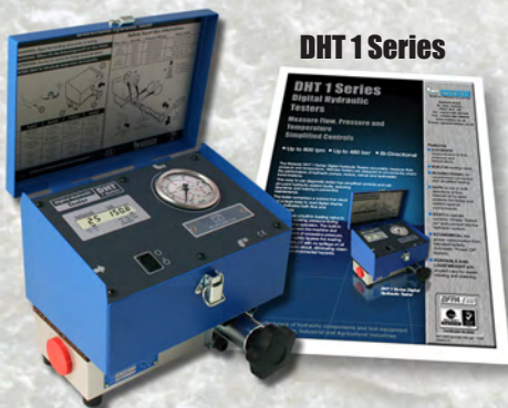
DHT 1 Series

See our technical bulletin for full specifications