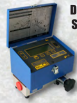
DHM '3' Series