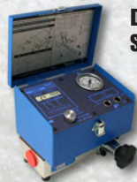
DHT '2' Series