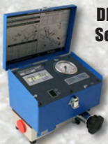
DHT '1' Series