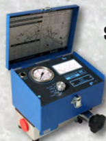
HT '2' Series