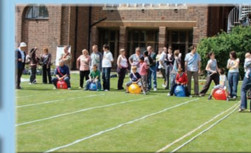
The Webtec Olympics