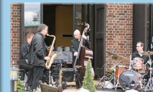
Jazz Band, Homerton College, Cambridge