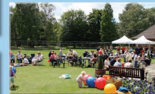
Webtec Summer Garden Party July 2008